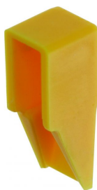
Insulating cap, Colour: Yellow