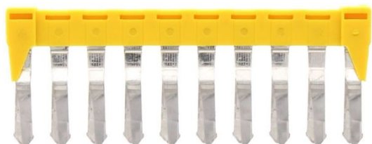
Insulated cross-connector, No. of poles: 10, Mounting type: Plug in, Width: 60.1 mm, Rated cross-section: 4 mm 2 , Colour: Yellow