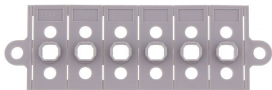
Adapter plate, Colour: Grey