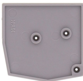
Partition plate, Width: 3 mm, Colour: Grey