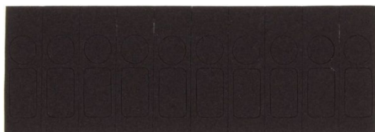
Seal, Colour: Dark grey