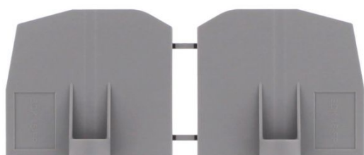
Flange plate, Colour: Grey