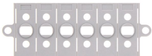
Partition plate, Colour: Grey