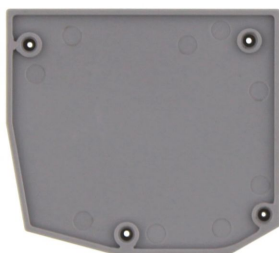
Partition plate, Colour: Grey