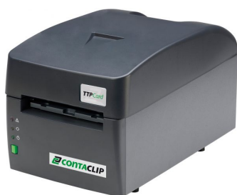
Thermal transfer printer