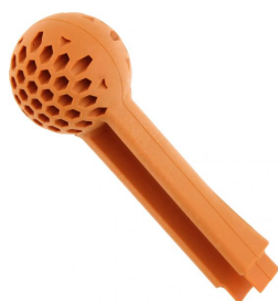
Actuating tool, Material: Polyamide