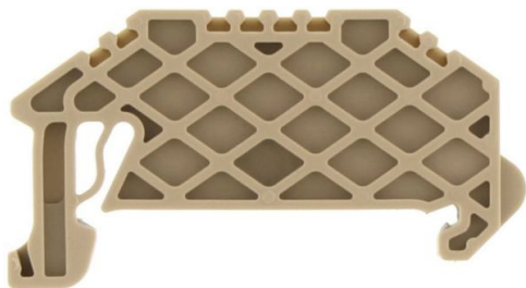
End stop, Mounting type: Mounting rail TS 35/7.5 and TS 35/15, Width: 5 mm, Colour: Beige