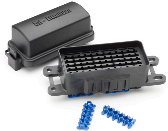
HWB60 accepts plug-in circuit protection components with 280 style footprint.