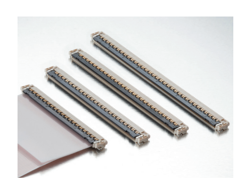
Slim Type 0.50mm Pitch FFC/FPC Connectors

104075 68-Circuits104114 80-Circuits104083 96-Circuits