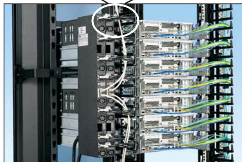
Complete POU Solution