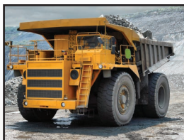
Specialty Trucks, such as Dump Trucks, Garbage Trucks, Concrete Trucks, Utility Trucks