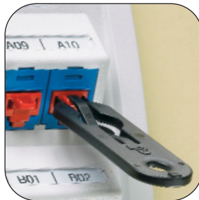
To release: insert the special removal tool which attaches to the blockout device