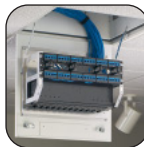
Zone Cable Boxes