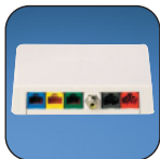
Surface Mount Boxes