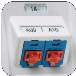
To install: snap the blockout device into the jack module