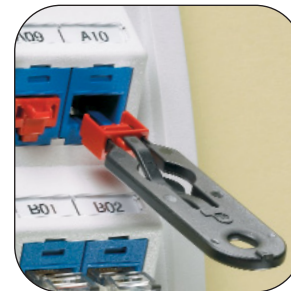
To remove: retract the device