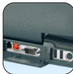
Computer Data Jacks