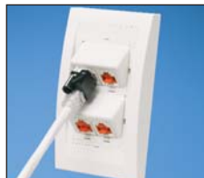
PSL-DCPLX and PSL-DCPLRX