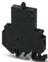
Thermomagnetic circuit breaker, 1-pos., fast blow, 1 N/C contact, with universal foot for mounting on NS 32 or NS 35

Please be informed that the data shown in this PDF Document is generated from our Online Catalog. Please find the complete data in the user's documentation. Our General Terms of Use for Downloads are valid ( http://phoenixcontact.com/download )