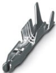
Crimp contact, type of contact: Female connector, connection method: Crimp connection, contact surface: Tin

Please be informed that the data shown in this PDF Document is generated from our Online Catalog. Please find the complete data in the user's documentation. Our General Terms of Use for Downloads are valid ( http://phoenixcontact.com/download )