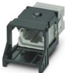
Fiber optic coupling, degree of protection: IP20, connection method: Coupling, cable outlet: straight

Please be informed that the data shown in this PDF Document is generated from our Online Catalog. Please find the complete data in the user's documentation. Our General Terms of Use for Downloads are valid ( http://phoenixcontact.com/download )