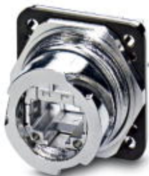
RJ45 mounting frame, IP67, for bayonet interlocking, metal, with contact insert for cable connection, for round mounting cutout, with seal, without mounting screws

Please be informed that the data shown in this PDF Document is generated from our Online Catalog. Please find the complete data in the user's documentation. Our General Terms of Use for Downloads are valid ( http://phoenixcontact.com/download )