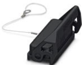
Protective cover D25, with single locking latch, protective cover material: PA, height: 19 mm

Please be informed that the data shown in this PDF Document is generated from our Online Catalog. Please find the complete data in the user's documentation. Our General Terms of Use for Downloads are valid ( http://phoenixcontact.com/download )