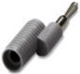
Reducing plug, color: gray