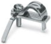
Shield connection clamp for printed circuit terminal block

Shield connection clamp - ME-SAS - 2853899