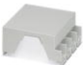
DIN rail housing, Upper housing part for connectors with header, width: 90.4 mm, height: 99 mm, depth: 45.85 mm, color: light gray (7035)

Upper part of housing - ME 90 OT-1MSTBO KMGY - 2200523