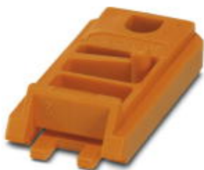
Component housing, Base latch, width: 14.4 mm, height: 29.8 mm, depth: 5.9 mm, color: orange (2003)

Please be informed that the data shown in this PDF Document is generated from our Online Catalog. Please find the complete data in the user's documentation. Our General Terms of Use for Downloads are valid ( http://phoenixcontact.com/download )