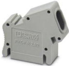
Cable housing, width: 10.4 mm, number of positions: 2, color: gray

Please be informed that the data shown in this PDF Document is generated from our Online Catalog. Please find the complete data in the user's documentation. Our General Terms of Use for Downloads are valid ( http://phoenixcontact.com/download )