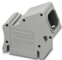
Cable housing, width: 15.6 mm, number of positions: 3, color: gray

Please be informed that the data shown in this PDF Document is generated from our Online Catalog. Please find the complete data in the user's documentation. Our General Terms of Use for Downloads are valid ( http://phoenixcontact.com/download )