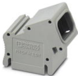
Cable housing, width: 20.8 mm, number of positions: 4, color: gray

Please be informed that the data shown in this PDF Document is generated from our Online Catalog. Please find the complete data in the user's documentation. Our General Terms of Use for Downloads are valid ( http://phoenixcontact.com/download )