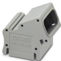
Cable housing, width: 26 mm, number of positions: 5, color: gray

Please be informed that the data shown in this PDF Document is generated from our Online Catalog. Please find the complete data in the user's documentation. Our General Terms of Use for Downloads are valid ( http://phoenixcontact.com/download )