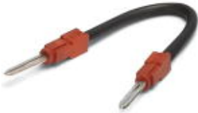
The figure shows the 60 mm version

Wire bridge, length: 110 mm, width: 5.1 mm, number of positions: 1, color: red/black