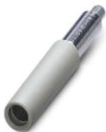
Female test connector, color: gray

Please be informed that the data shown in this PDF Document is generated from our Online Catalog. Please find the complete data in the user's documentation. Our General Terms of Use for Downloads are valid ( http://phoenixcontact.com/download )