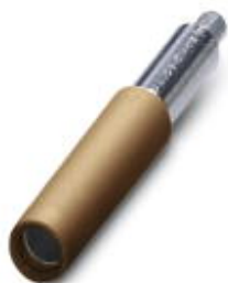
Female test connector, color: brown

Please be informed that the data shown in this PDF Document is generated from our Online Catalog. Please find the complete data in the user's documentation. Our General Terms of Use for Downloads are valid ( http://phoenixcontact.com/download )