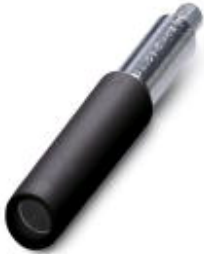
Female test connector, color: black

Please be informed that the data shown in this PDF Document is generated from our Online Catalog. Please find the complete data in the user's documentation. Our General Terms of Use for Downloads are valid ( http://phoenixcontact.com/download )