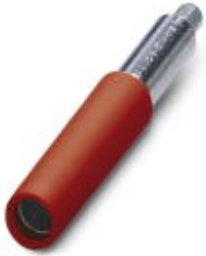
Female test connector, color: red

Please be informed that the data shown in this PDF Document is generated from our Online Catalog. Please find the complete data in the user's documentation. Our General Terms of Use for Downloads are valid ( http://phoenixcontact.com/download )