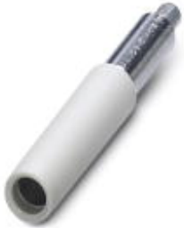
Female test connector, color: white

Please be informed that the data shown in this PDF Document is generated from our Online Catalog. Please find the complete data in the user's documentation. Our General Terms of Use for Downloads are valid ( http://phoenixcontact.com/download )