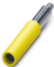
Female test connector, color: yellow

Please be informed that the data shown in this PDF Document is generated from our Online Catalog. Please find the complete data in the user's documentation. Our General Terms of Use for Downloads are valid ( http://phoenixcontact.com/download )