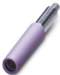
Female test connector, color: violet

Please be informed that the data shown in this PDF Document is generated from our Online Catalog. Please find the complete data in the user's documentation. Our General Terms of Use for Downloads are valid ( http://phoenixcontact.com/download )