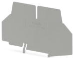
Separating plate, length: 105.2 mm, width: 1 mm, height: 67.5 mm, color: gray

Please be informed that the data shown in this PDF Document is generated from our Online Catalog. Please find the complete data in the user's documentation. Our General Terms of Use for Downloads are valid ( http://phoenixcontact.com/download )