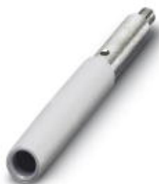
Female test connector, color: gray

Please be informed that the data shown in this PDF Document is generated from our Online Catalog. Please find the complete data in the user's documentation. Our General Terms of Use for Downloads are valid ( http://phoenixcontact.com/download )