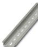
DIN rail perforated, Standard profile, width: 35 mm, height: 7.5 mm, acc. to EN 60715, material: Steel, galvanized, passivated with a thick layer, length: 2000 mm, color: silver

DIN rail perforated - NS 35/ 7,5 PERF 2000MM - 0801733