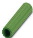
Insulating sleeve, color: green