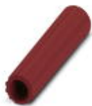
Insulating sleeve, color: red