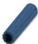
Insulating sleeve, color: blue