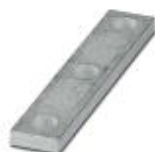
Connection rail, number of positions: 3, color: silver