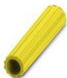
Insulating sleeve, color: yellow