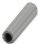
Insulating sleeve, color: gray