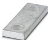
Connection rail, number of positions: 2, color: silver