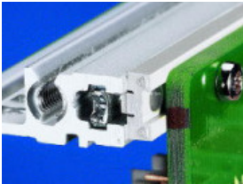
Rear horizontal rail for backplane mounting with insulation strip