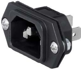
6100 with sealing to appliance