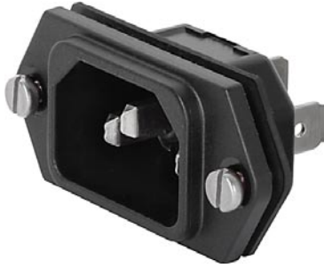
6100 with sealing to appliance