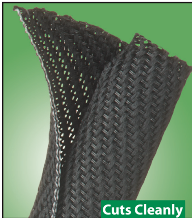
Cuts Cleanly Hot Knife

Colors Available: Black w/White Tracer (TB)