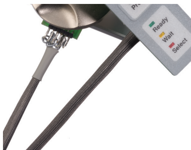
Protect component wiring leads from heat and abrasion with Insultherm Tru-Fit for an attractive and permanent finish.

Insultherm Tru-Fit provides a sturdy, long lasting, and inexpensive insulation solution. It is flexible and expandable, and can easily be installed over applications with irregular shapes and tight turns. Standard colors are Black and Natural, but other colors are available by special order. Contact your account representative for details.