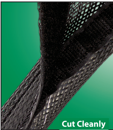
Cut Cleanly Hot Knife