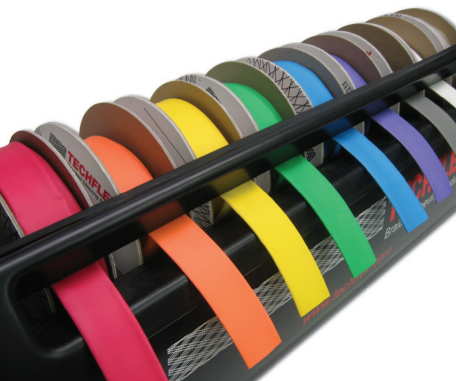
Shrinkflex shop spools fit into our dispenser kit (pg. 119) for easy storage and organization.

When economy is priority, 2:1 Shrinkflex heatshrink tubing is the answer. Not as versatile as a high ratio shrink product, 2:1 will still slide easily over small inline splices and connectors and provide a tight seal in many applications.