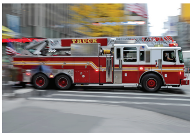
When hose and wire protection is critical, you can depend on Techflex to find the right solution.