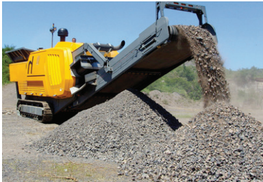
Aramid Armor is designed to keep wires and hoses protected in the harshest situations.