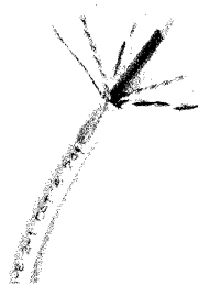
XG FTP Cable

X denotes jacket color: 4--1 = White, 4--3 = Gray, 4--5 = Blue, 4--7 = Yellow