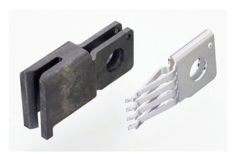
Reference Part Number* 104742-2