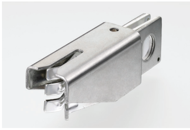
Reference Part Number* 104501-1