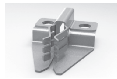
Reference Part Number* 104502-1