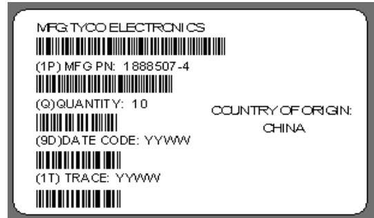
图 2 (only for 1888507-4;6368062-1/2)

---其中(9D)Date code及(1T)trace都是指日期，格式是YYWW.