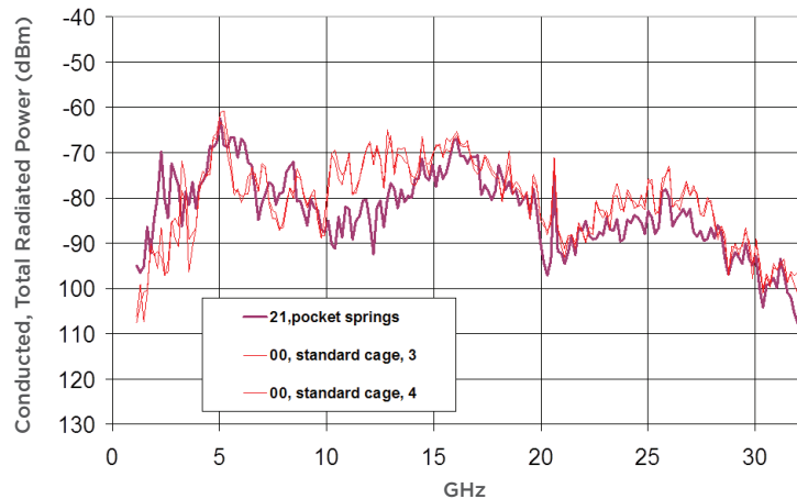
SFP+ 2x4 EMI-Enhanced Cage vs. SFP+ 2x4 Standard Cage

A pocket spring has been added to the latch plate area to further reduce EMI emission. This component is internal to the cage assembly. The additional component still allows airflow through the front of the cage assembly.