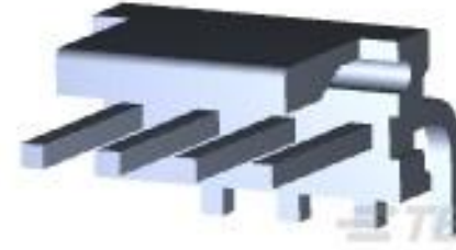
TE Model / Part #3-644754- 4 04P MTA156 HDR ASSY SQ R/A F/L