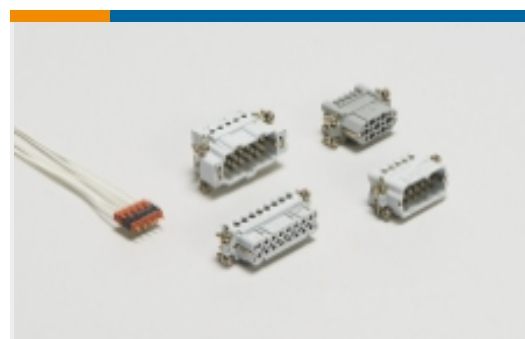
Rectangular Contact Inserts (7)