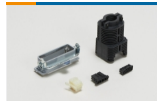
Rectangular Connector Housings(35)