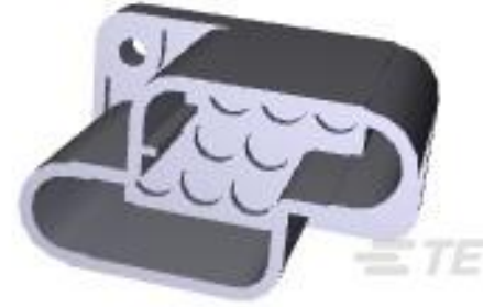
TE Model / Part #213500-1 RECPT HSG, 8 POWER, METRIMATE