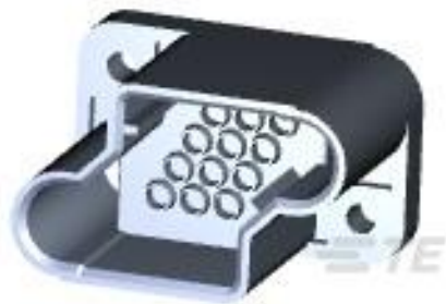
TE Model / Part #211759-1 RECEPT HSG, 12 POSN, METRIMATE