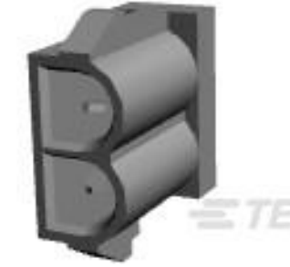
TE Model / Part #173924-1 2 P ACTION PIN UMNL