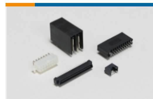
Standard Rectangular Connectors(88)