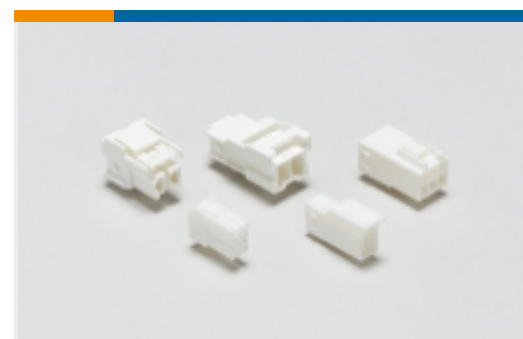
Rectangular Power Connectors(3)