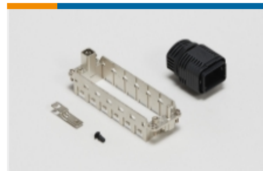
Rectangular Connector Hardware(4)