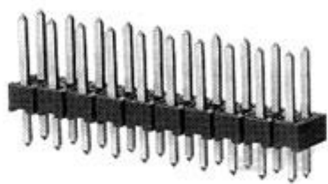
TE Model / Part #5-146258- 1 02 MODII HDR DRST B/A . 100CL