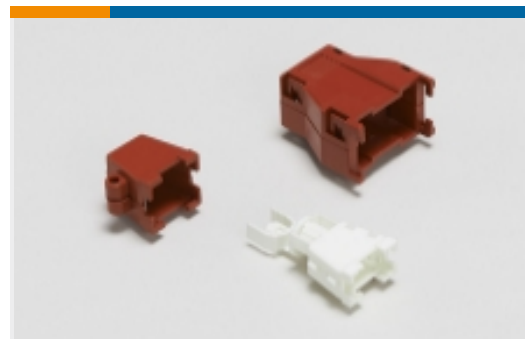
Rectangular Boots & Strain Relief(9)