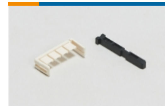
Rectangular Connector Keying Plugs(1)