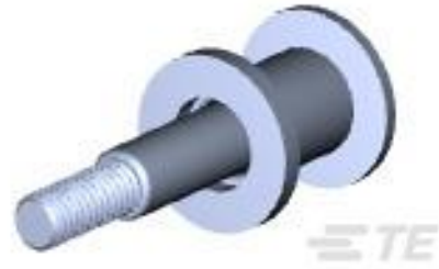
TE Model / Part #213283-2 HARDWARE KIT, DRAWER CONN