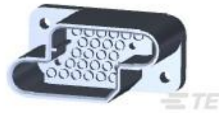
TE Model / Part #211149-1 PIN HSG, 25 POSN, METRIMATE